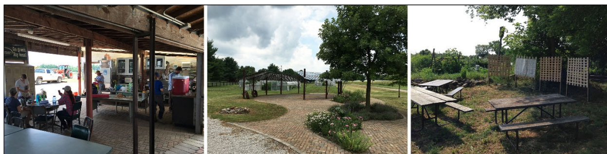
Figure 4. Indoor Primary Gathering Area at Farm Hub (Left); Outdoor Event-Sized Gathering Area (Middle); Outdoor Primary Gathering Area (Right)

Thriving multifunctional gathering areas tend to include the following features: cover from sun and rain, seating, flat spaces for tables or chairs, and easy access from within the farm. The gathering spaces were entirely either open-air, inside a structure, or more often, a combination of both. Larger farms tended to have two to