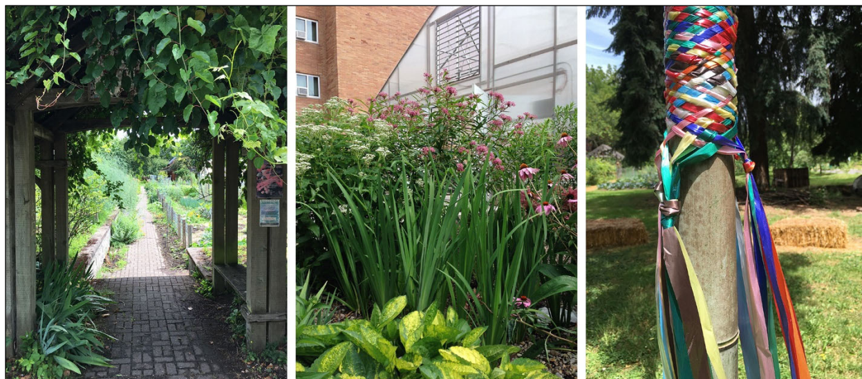
Figure 5. Types of Attractions: Entryways and Edges (left), Ornamental Demonstration Planting (Middle), Farm Craft (Right)

Ornamental and demonstration plantings were used to attract and interest people at the farm. These plantings tended to take the form of rain gardens, entryway plantings, U-pick flowers, or pollinator gardens or pods. One farm manager said,