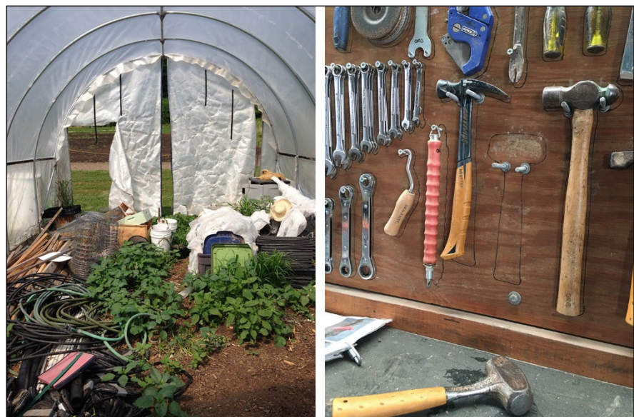
Figure 3. Season Extension Structure Converted to Needed Covered Storage (Left); Systematic Organization of Tools at Farm Hub (Right)

Locating primary storage areas at the central hub is important for three key reasons: consolidation, organization, and socialization. First, having all equipment and tools in a designated, centralized area increased work efficiency by guaranteeing availability and access. For example, one student worker noted, "It's nice that the tools are around here. Everything is pretty accessible. I like that it's