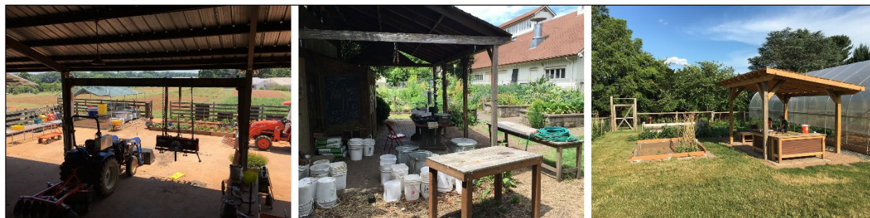
Figure 2. Farm Hubs: Large (Left), Medium (Center), Small (Right)

the primary node where the work day starts and ends. The farm hub acts as a site landmark and orienting feature that one manager described as “key because it’s a central location where you can tell people to meet you” (F8). Especially given varied staff schedules and high numbers of volunteers, the farm hub was consistently identified as a key feature for farm efficiency and productivity because it centralized farm management spaces. The physical design of well-established farm hubs serves four key functions: site organization, circulation, administration, and storage. While the hub serves as a point of informal gathering and socializing due to its primary functions, formal gathering areas are distinct features of successful student farms that may or may not be incorporated within the hub area (see Domain 2).