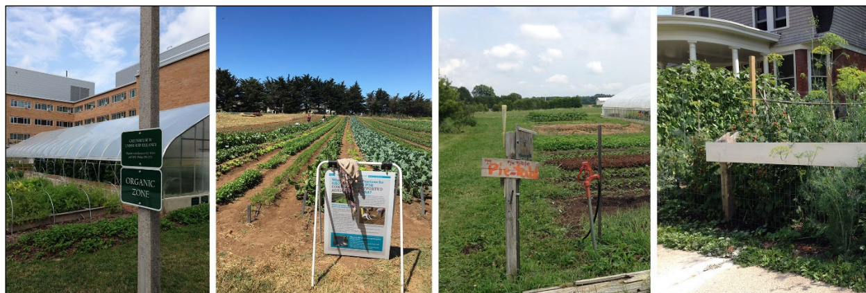
Figure 6. Professional Signage (Left and Center Left); Dilapidated Handmade Signage (Right and Center Right)

Meanwhile, respondents also identified challenges with the coordination, quality, and maintenance of student projects (Figure 7). For example, a student's accountability to complete a project can be tenuous and lead to piecemeal work. In addition, student-driven work may not be required to follow professional standards, especially when exploring innovative techniques or materials. This