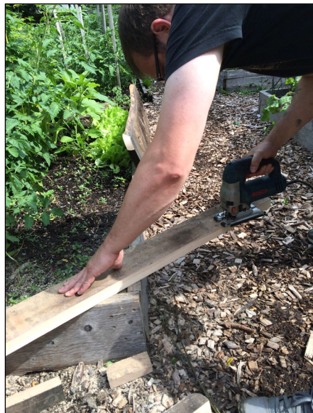
Figure 3. Evan working on the bench in the community garden.

skill that we were so used to, being present in both the design and building processes (see Figure 3).