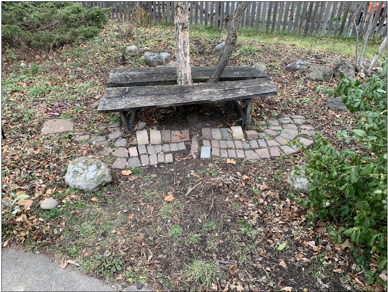
Figure 2. The finished bench in situ.