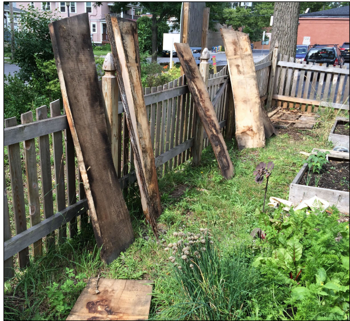
Figure 1. Maple planks leaning against the fence of the community garden.

As we worked together with other gardeners to examine the shapes of the planks, to use the tools that surfaced them and drilled holes and installed hardware, I had the opportunity to watch Evan's deft hand with managing diverse voices and skillsets within a project. He worked with the cheerfulness and