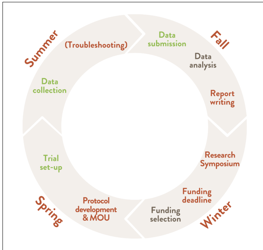
Figure 1. Cycle of Ecological Farmers Association of Ontario's (EFAO) Farmer-Led Research Program Outlining Responsibilities for Farmers (Green), EFAO Staff (Brown), and Farmer-Researchers Together with EFAO Staff (Red)

The research team used the logic model and priority research themes to develop a 34-question online survey (see Appendix A), which included questions regarding current, past, and future use of ecological management practices; knowledge, motivation, and confidence in ecological practices; barriers to ecological practices; social networks; and how each of these areas was influenced by various types of involvement with the EFAO. The EFAO distributed the survey via its listserv 2 on multiple occasions. Between February and September 2020, 139 responses from across Ontario were recorded. Survey respondents were invited to volunteer for a follow-up semi-structured interview designed to gather more in-depth information about engagement with and opinions regarding the FLRP. Volunteers were randomly selected and a total of 17 were interviewed between November 2020 and April