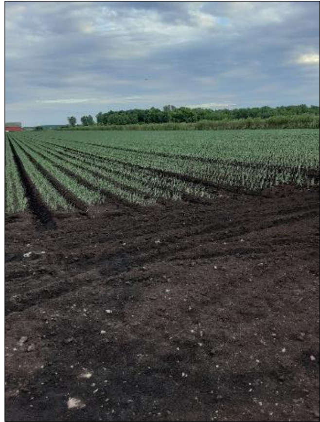
Photo 1. Black Dirt Soil in New York State

What makes New York black dirt onions taste special