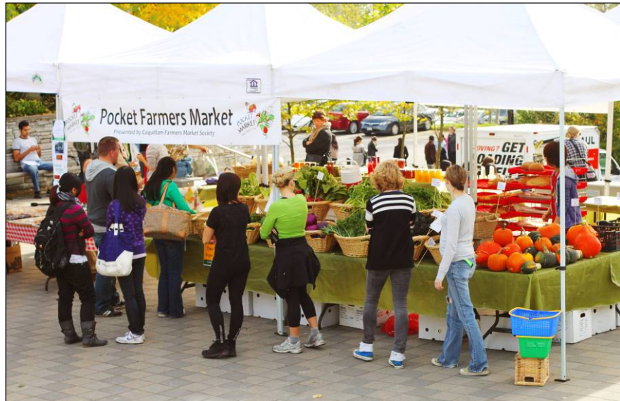
Figure 1. Outdoor Pocket Market

A pocket market located outdoors at a university. The target audience is staff, faculty, students, and residential community members.