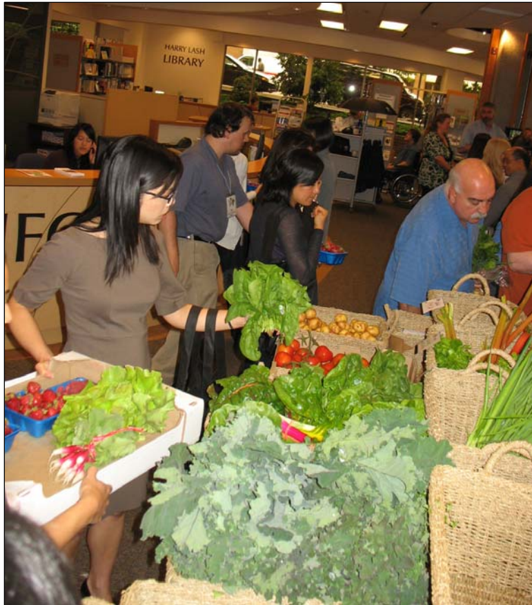
Figure 3. Indoor Pocket Market

A pocket market set up in an office lobby allows people to “buy local” where they work.