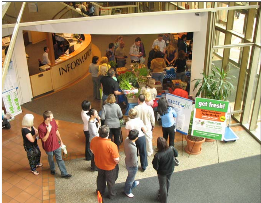
Figure 2. Indoor Pocket Market

This pocket market is located in the lobby of a government office building. Its target audience is the professional and support staff who work there. The pocket market reinforces the organization's commitment to employee health and wellness.