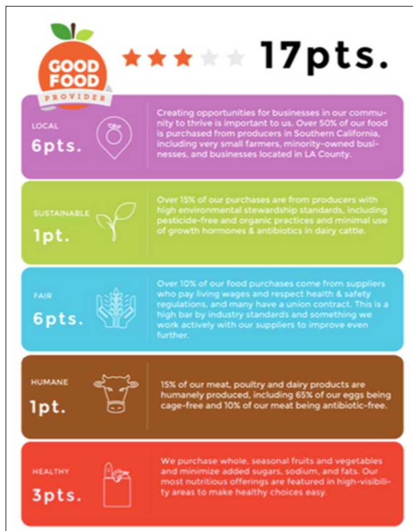
Figure 2. GFPP Scoring Example