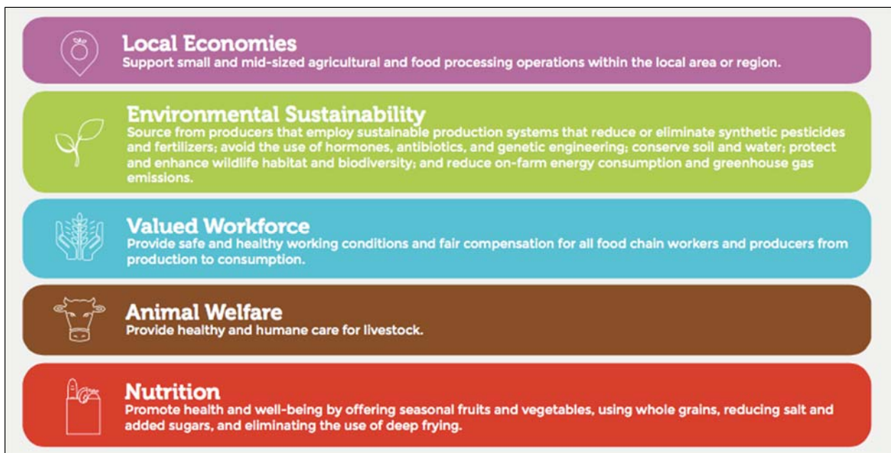
Figure 1. The Five Values of the Good Food Purchasing Policy