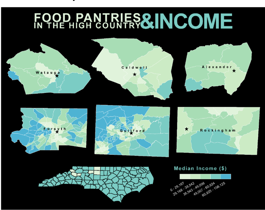
Figure 2. Pilot Study GIS Mapping Example: Median Income at the Census Tract and Food Pantry Locations