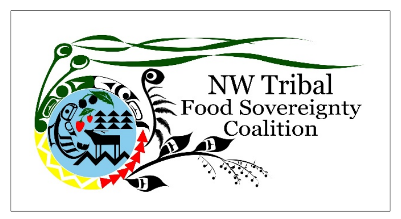
Figure 1. Northwest Tribal Food Sovereignty Coalition Logo Representing the Diversity of Plant and Wildlife of the Region

After the initial meeting, a leadership work-group met via conference call and in person to brainstorm the vision, mission, and values of the coalition. Although still in development, the NTFSC's working mission is to "reclaim our indigenous knowledge to maintain and improve our health and quality of life for ourselves and future generations." A final version of these will be published on the NPAIHB website under the NTFSC page (NPAIHB, n.d.-b).