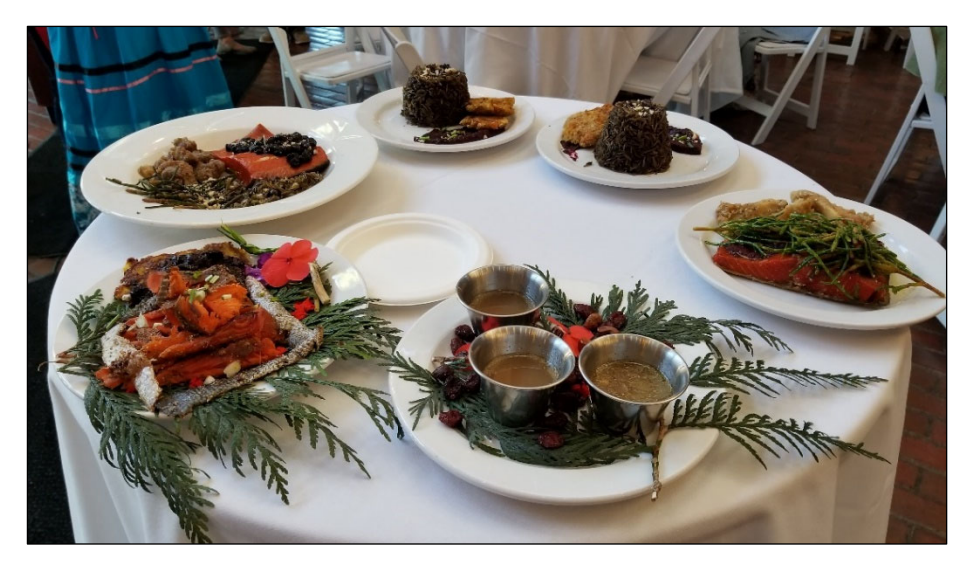
Figure 2. Plated Food from the "Native Chopped" Cooking Competition Awaiting Critique by the Elder Judges

medicines), skill-building break-out sessions, a "Native Chopped" cooking competition (Figure 2), and a traditional dinner with salmon, shellfish, and other traditional foods (Figure 3).