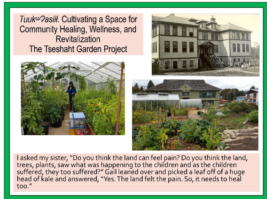
Figure 9. The Tseshaht Garden Project

It's a garden that grows kale and spinach and carrots and squash. My sister created it in my community for one main reason. If you can see there on the right, there is a building. That building is a boarding school that shut down in the 1970s. When it was shut down, we removed that building and we built our Nuu-chah-nulth Tribal Council there. The council serves all 14 of our nations, but that space, that land that's there on the bottom right, where you see the garden, that was, and I put in air quotes, "a playground." Children never played in these schools. They were always under surveillance. They were always waiting to see if they would be the next victims of the people who abused them in these schools. There was a lot of violence and trauma that happened in these