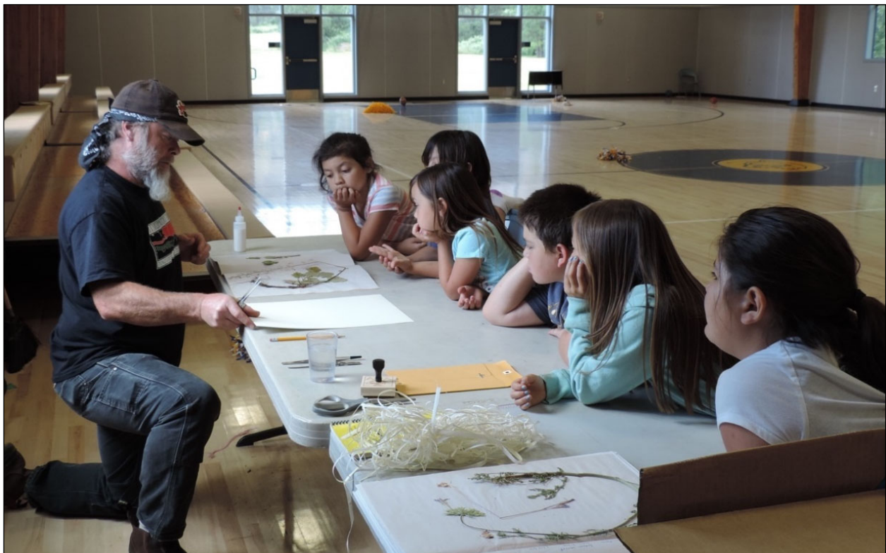
Figure 3. Youth in Orleans, California, Learning about Pressing and Mounting Herbarium Voucher Specimens for the Karuk Herbarium

Development of extension programming in tribal