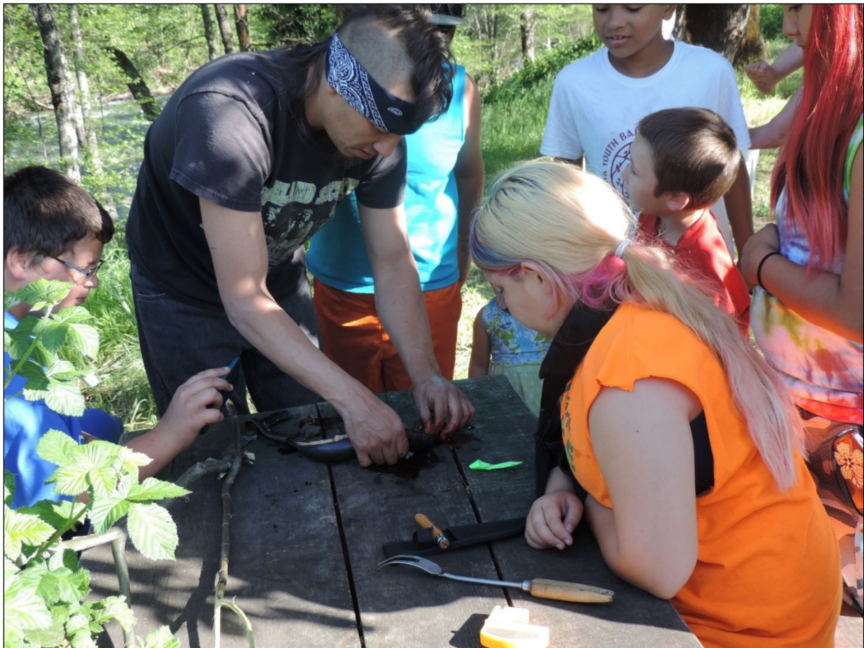
Figure 2. Youth in Happy Camp, California, Learn How to Prepare and Cook Pacific Lamprey ( Lampetra tridentate )

The increased number of elementary school students conducting research on Karuk tribal history and sovereignty may also be attributable to this tribal curriculum. The results of the 2016 Karuk Tribal Needs Assessment for K-12 Education demonstrated the overwhelming support for