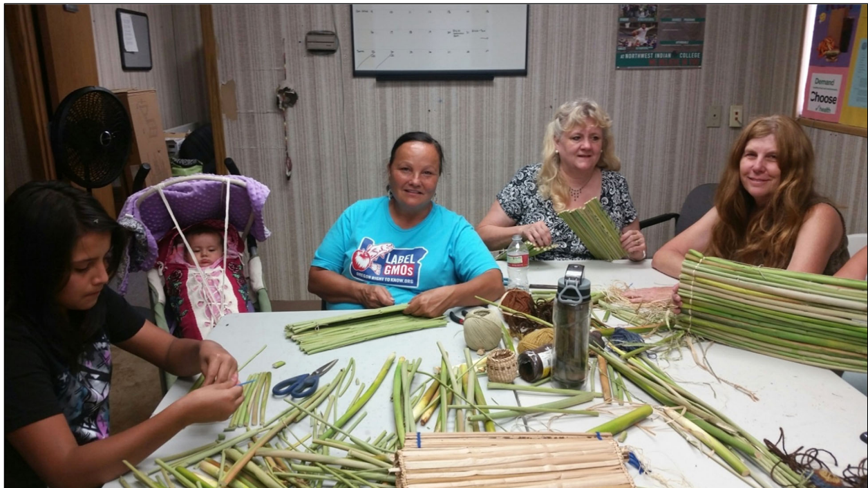
Figure 4. Women Weaving Tule Mats at a Workshop in the Upper Klamath River Basin

hosted 238 regular workshops and 58 seasonal food camps focused on understanding, finding, gathering and processing edible native foods and fibers as well as other subsistence skills, reaching thousands of tribal members and descendants with knowledge that had been lost to many families, and this programming continues. Taught by experienced cultural practitioners and tribal elders, Native food workshop offerings have included acorn harvest and preparation, eel preparation, salmon smoker construction, pit oven cooking, deer and salmon canning, hide tanning, camas digging and cooking, wocus harvest and preparation, tule mat weaving, traditional basketry, willow gathering, spring medicine, history of management practices, fish and plant identification, and many more activities (Figure 4). At the end of each event, participants evaluated how much they had learned and their intent to apply what they learned. While responses varied somewhat, the majority of participants found them beneficial. For example, 80% to 100% of participants across all camps reported learning something new, and 63% to 100% said that they wanted to learn more or to implement what they learned. One participant shared the value