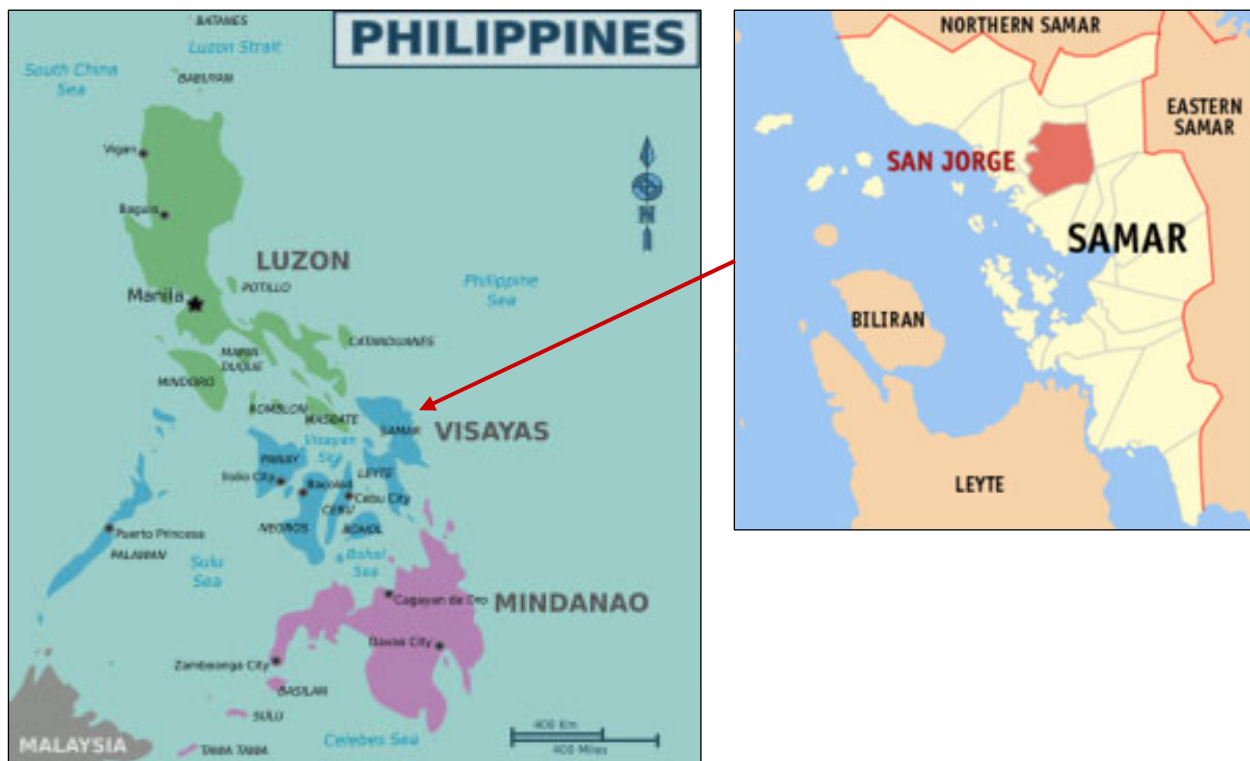
Figure 1. The Philippines and San Jorge, Samar

I collected secondary data from government offices and conducted an ocular survey, direct observation, focus group discussion, and individual interviews with residents who were affected by the COVID-19 pandemic.