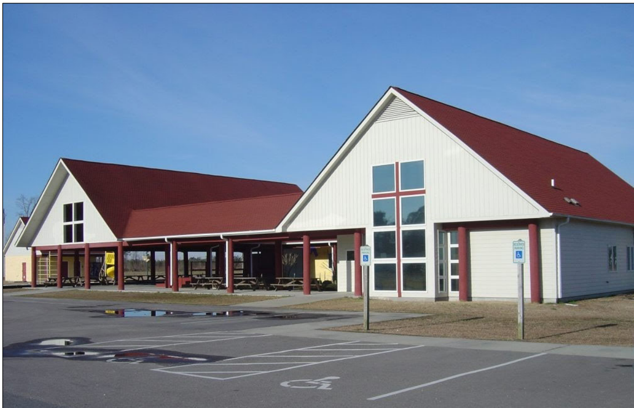
Figure 1. The Episcopal Farmworker Ministry (EFWM) Facility in Dunn, North Carolina