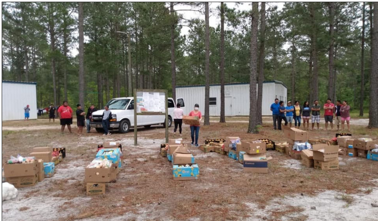
Figure 3. Food Distribution to Farmworkers