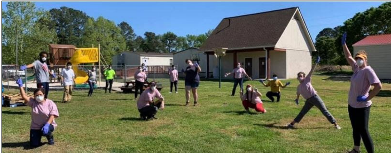
Figure 4. Volunteers During the Pandemic