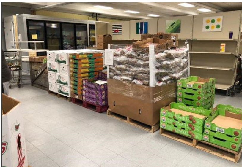
CARES's client choice food pantry after the pandemic.