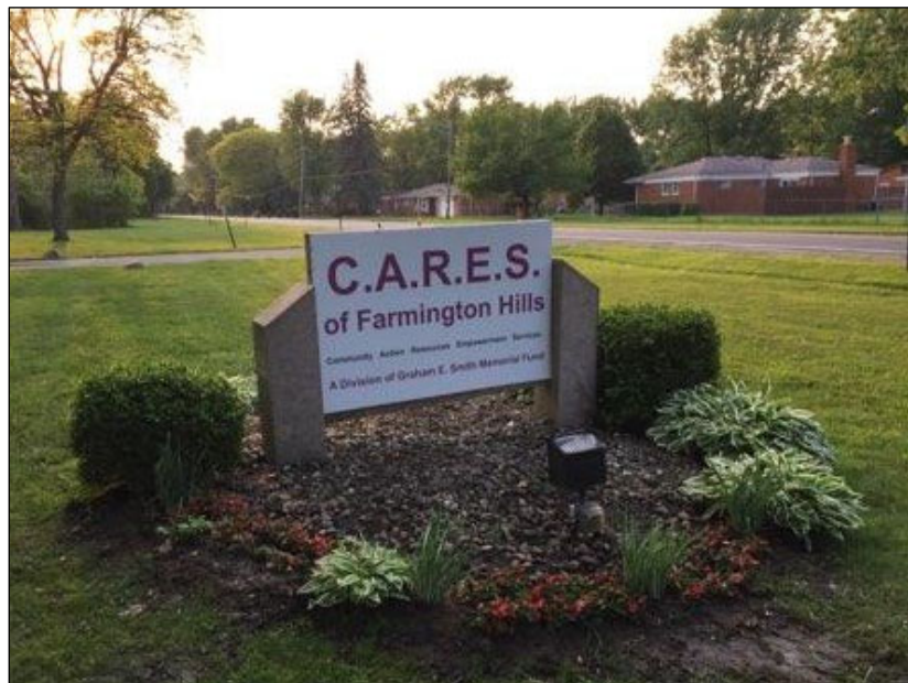
CARES of Farmington Hills is a front-line food pantry that serves nine cities in Michigan.

Another big thing that CARES of Farmington Hills was able to accomplish was getting licensed as a Bridge Card store. This lets us accept Bridge Cards (Michigan's version of SNAP EBT, "food stamps" electronic benefits transfer payments) as payment. The clothing room was converted into the new SNAP store. We are able to buy food from food companies and distributors so we have a well-