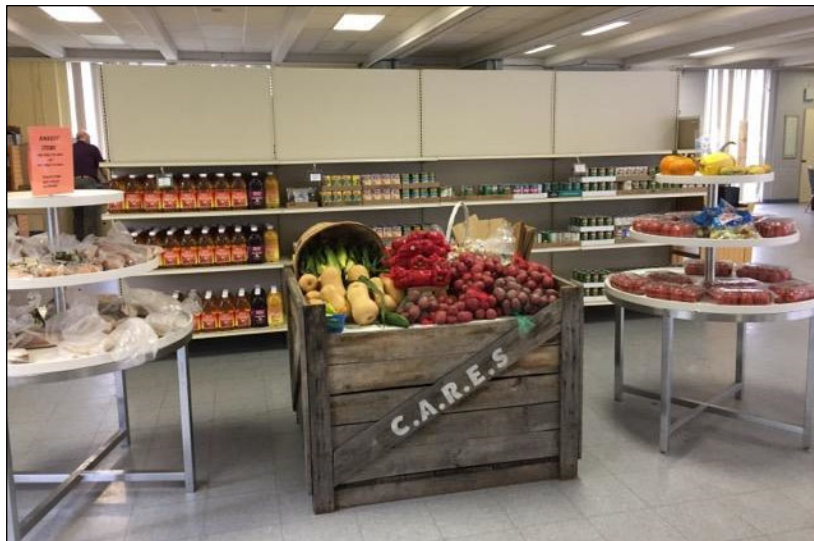
CARES's client choice food pantry prior to the pandemic.