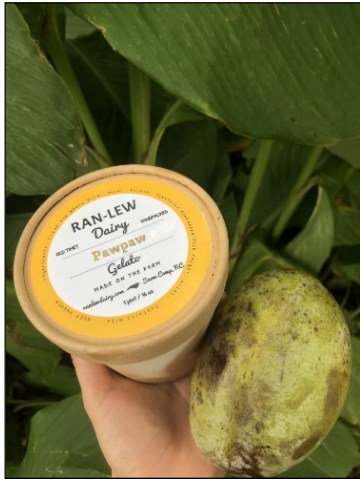
Figure 3. Pawpaw Gelato from Ran-Lew Dairy