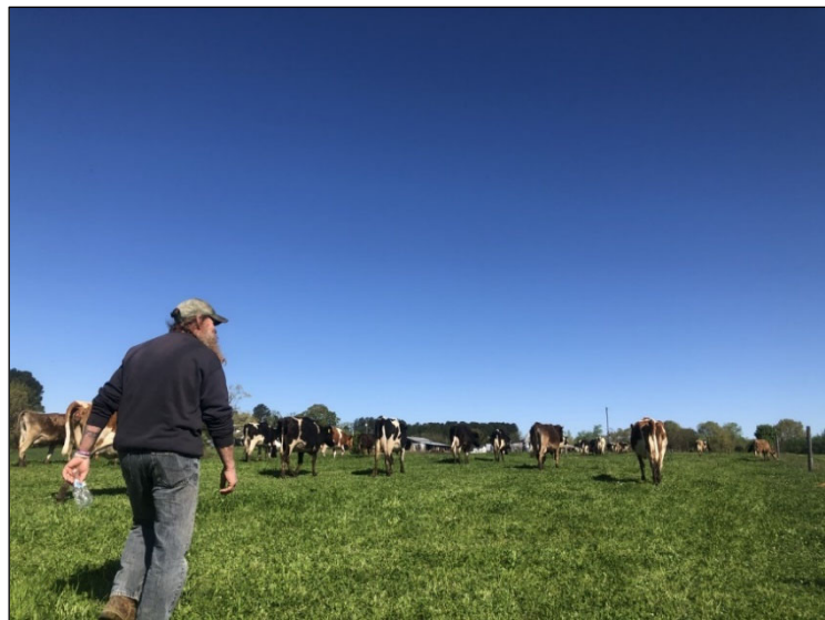
Figure 2. On Ran-Lew Dairy Farm