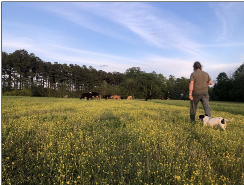
Figure 5. On Ran-Lew Dairy Farm