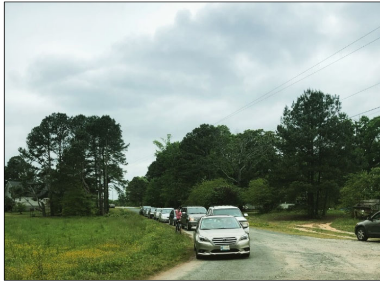
Figure 1. Ran-Lew's Socially Distanced On-farm Pick-up System

Ran-Lew is well positioned for another unique reason: it is vertically integrated. That is, it is fully in charge of its entire supply chain. The company raises its own cows, processes its cows' milk, and