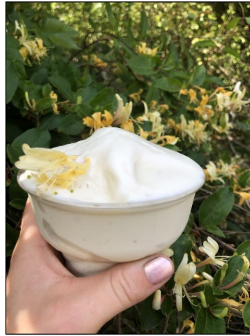
Figure 4. Honeysuckle Ice Cream from Ran-Lew Dairy